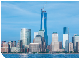
One World Trade Centre

Trusted & chosen on a range of architectural projects worldwide