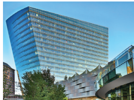
McKinney & Olive

Protecting glass on commercial towers across 6 continents