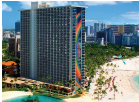
Hilton Hawaiian Village

Used by leading hotels to protect shower glass & reduce cleaning time